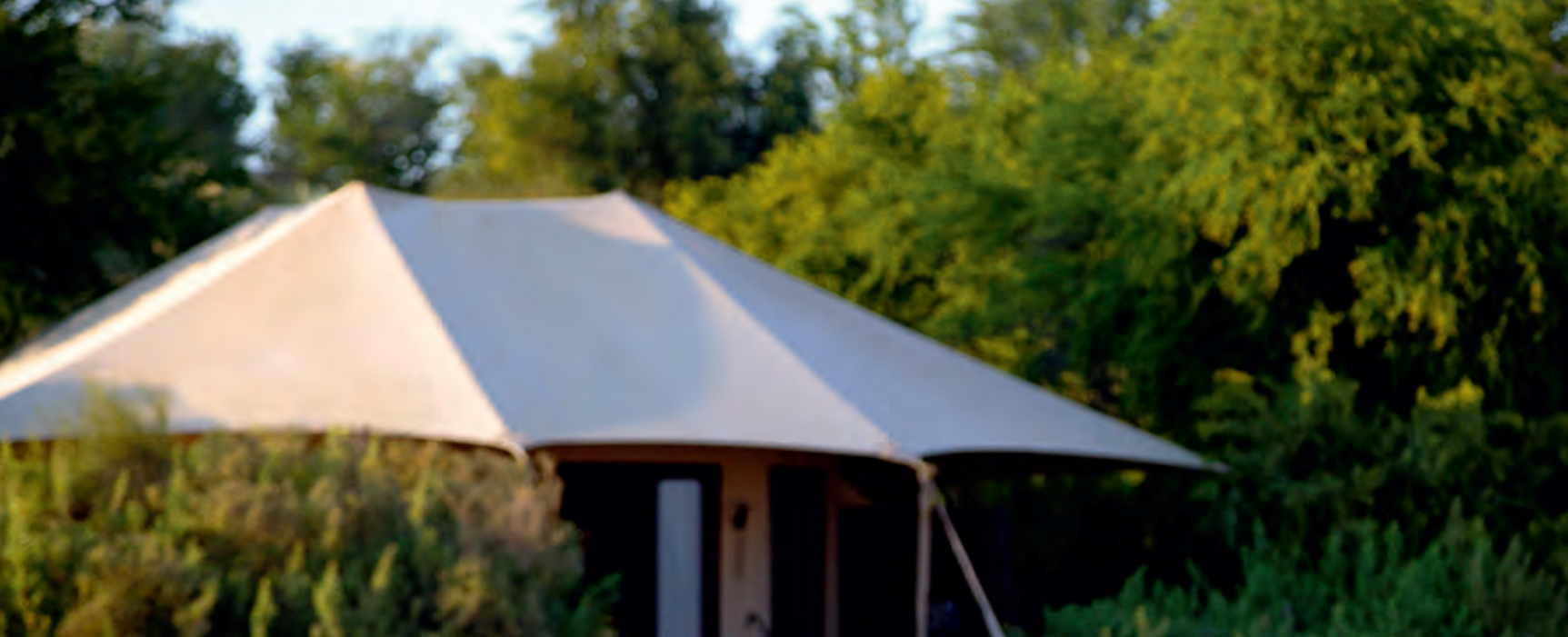
Clockwise from top left: Wildlife at Al Maha; Birkenhead House is on a cliff; a room at InterContinental Danang; kids interact with giant tortoises at Maritim Resort & Spa