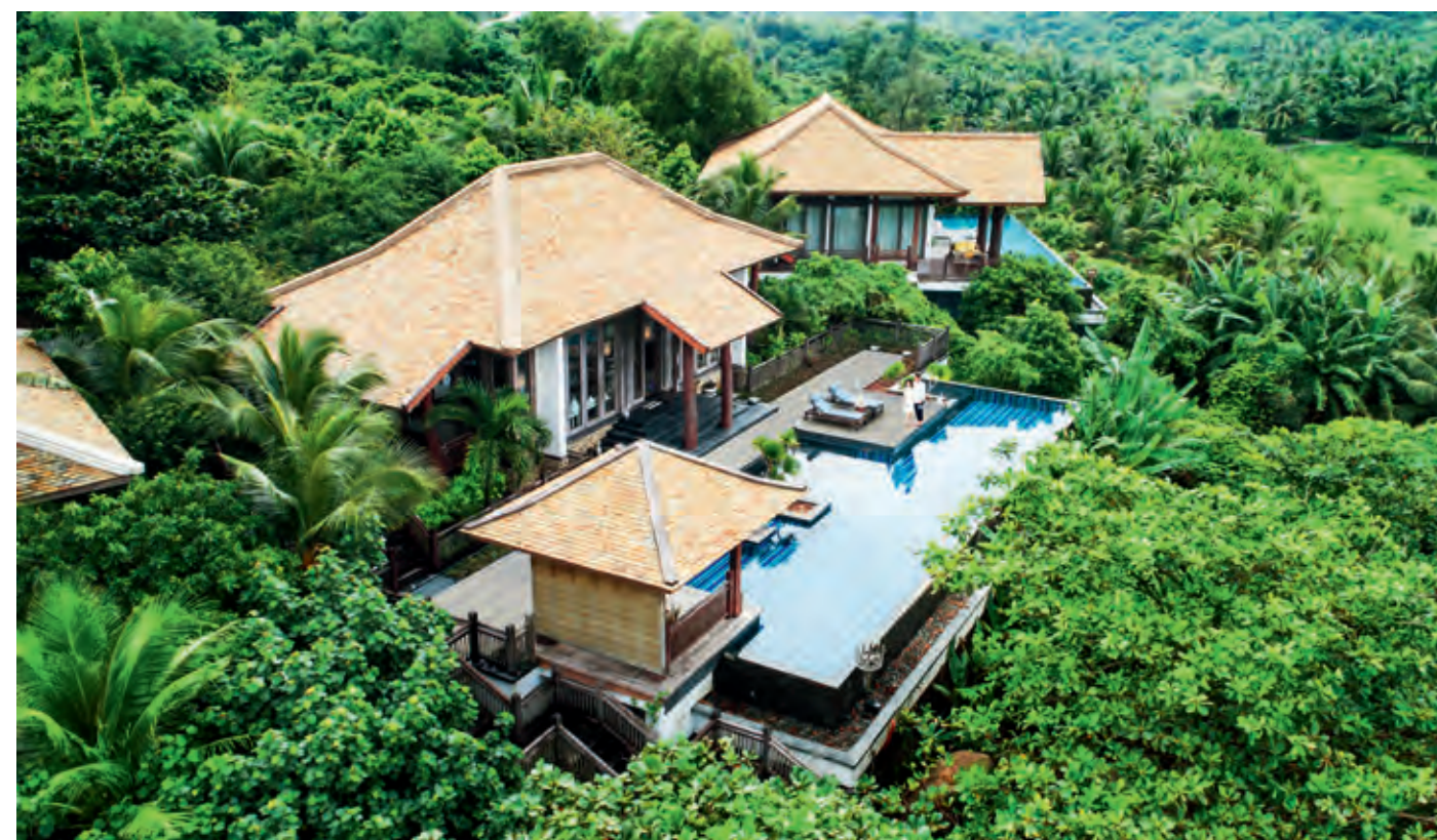
InterContinental Danang Sun Peninsula hotel. Opposite: Elephants at Anantara Golden Triangle in Thailand