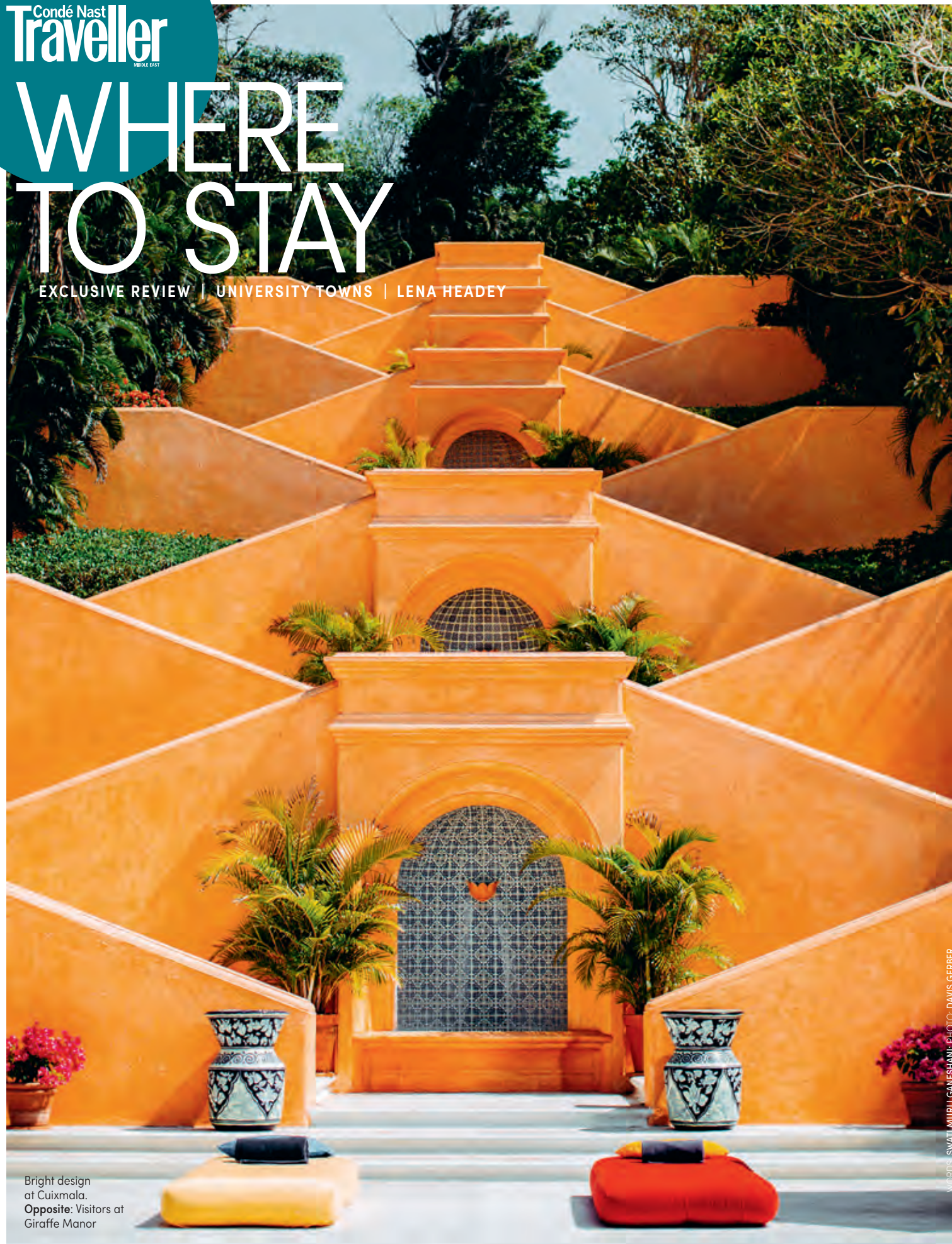
Bright design at Cuixmala. Opposite: Visitors at Giraffe Manor

EXCLUSIVE REVIEW | UNIVERSITY TOWNS | LENA HEADEY