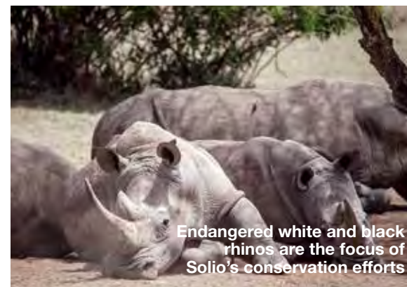
Endangered white and black rhinos are the focus of Solio's conservation efforts