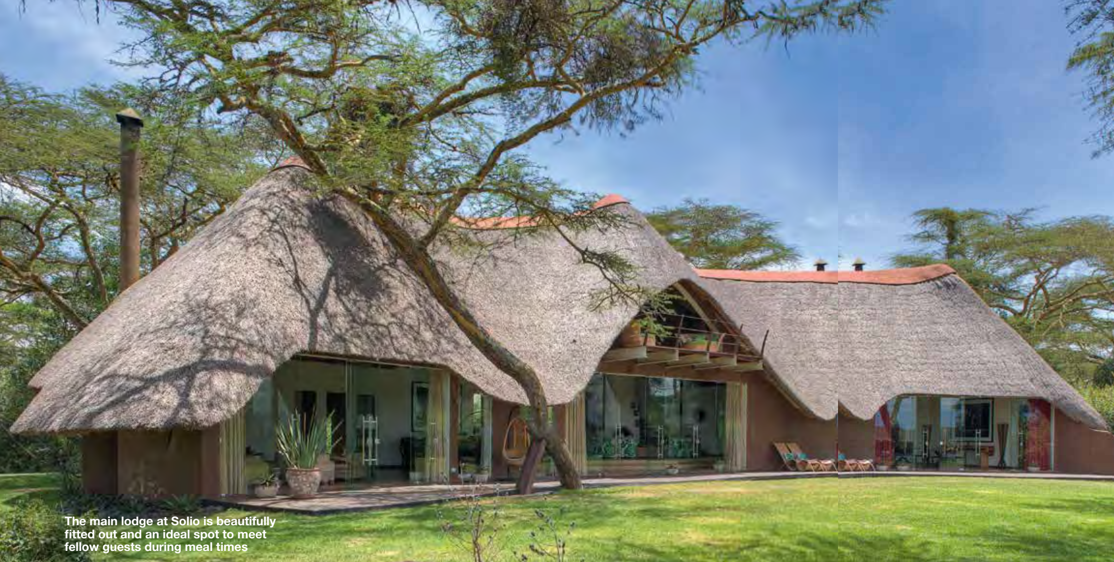
The main lodge at Solio is beautifully fitted out and an ideal spot to meet fellow guests during meal times