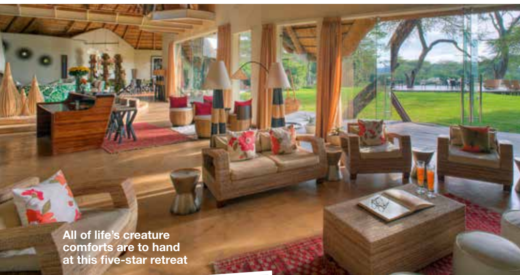
All of life's creature comforts are to hand at this five-star retreat