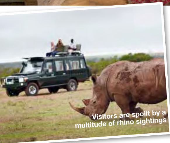
Visitors are spoilt by a multitude of rhino sightings