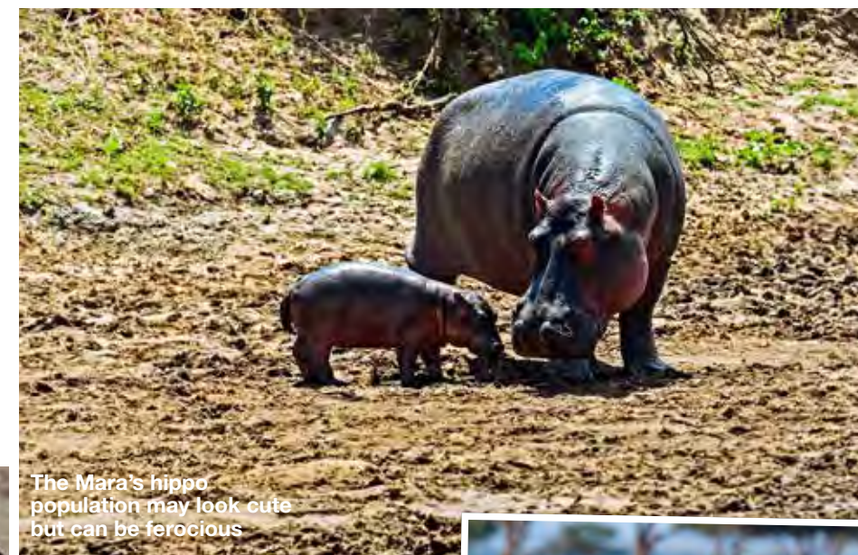
The Mara's hippo population may look cute but can be ferocious

'The seemingly endless 3,911 square-kilometre Maasai Mara is often lauded as the world's top safari destination'