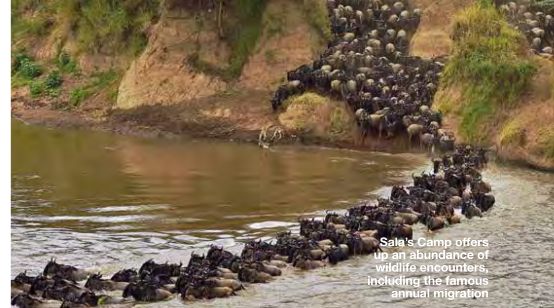
Sala's Camp offers up an abundance of wildlife encounters, including the famous annual migration

Sala's Camp is uniquely situated in the southern tip of the Mara, just where it meets the Tanzanian Serengeti. This prime sighting site, on the banks of the Sand and