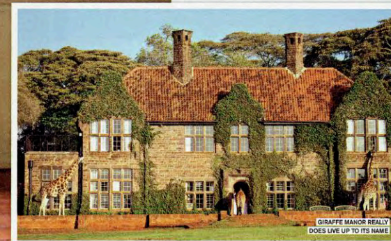
GIRAFFE MANOR REALLY DOES LIVE UP TO ITS NAME